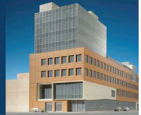
Example of Completed Sign

To see other permits issued on this property, visit www.nyc.gov/buildings